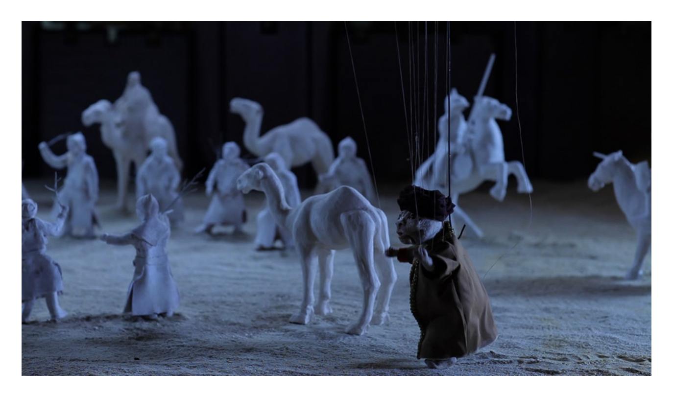
Wael Shawky, Cabaret Crusades: The Path to Cairo , 2012 (video still). HD video, color, sound, 60:00:53 min. Courtesy the artist and Sfeir-Semler Gallery, Beirut/Hamburg.

The project goes far beyond a simple retelling of the historical narrative. Throughout all three episodes, Shawky skillfully combines a historical script and the imaginative world of marionettes to create what the artist describes as a "surreal and mythical atmosphere that blends drama and cynicism." The environment blurs the lines between fact and fiction, truth and myth, and national history and bedtime fairy tales. He rapidly introduces characters, cities, and events through text on screen. Rather then educating, these references place the viewer within the frequently told history. The scenes of otherworldly singing, nuanced dancing, and simple human rituals underscore both the absurdity and the weight of the abstracted history. Shawky also frequently creates suspense through skillful deployment of silence; he presents entire war scenes from a child's point of view, using a slow moving camera in total silence to emphasize how anxieties are truly felt. The approach is daring and complex.