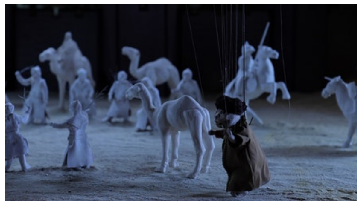
Wael Shawky, Cabaret Crusades: The Path to Cairo , 2012 (video still). HD video, color, sound, 60:00:53 min.

The project goes far beyond a simple retelling of the historical narrative. Throughout all three episodes, Shawky skillfully combines a historical script and the imaginative world of marionettes to create what the artist describes as a "surreal and mythical atmosphere that blends drama and cynicism." The environment blurs the lines between fact and fiction, truth and myth, and national history and bedtime fairy tales. He rapidly introduces characters, cities, and events through text on screen. Rather then educating, these references place the viewer within the frequently told history. The scenes of otherworldly singing, nuanced dancing, and simple human rituals underscore both the absurdity and the weight of the abstracted history. Shawky also frequently creates suspense through skillful deployment of silence; he presents entire war scenes from a child's point of view, using a slow moving camera in total silence to emphasize how anxieties are truly felt. The approach is daring and complex.