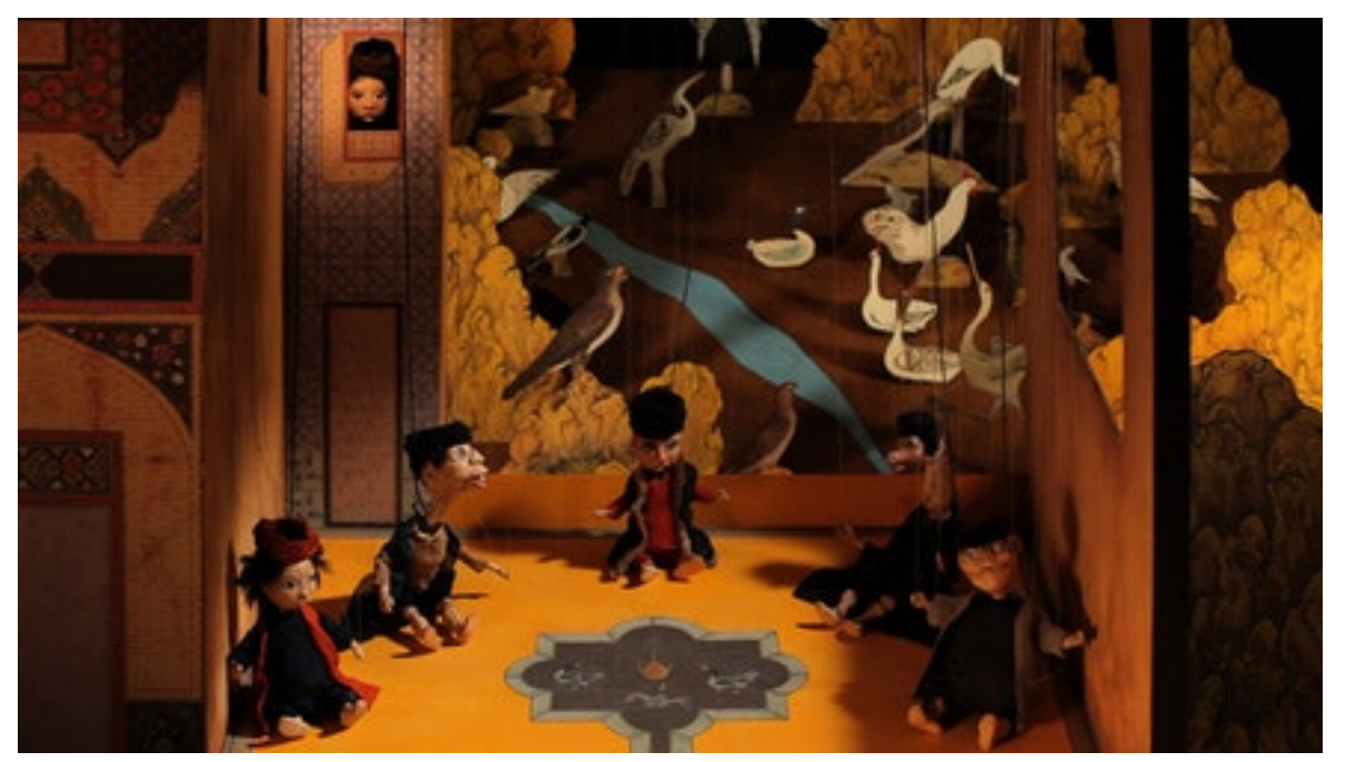
Wael Shawky, Cabaret Crusades: The Path to Cairo, 2012 (video still). HD video, color, sound, 60:00:53 min.

In The Path to Cairo Shawky critically assesses the complexities of Arab history during the First and Second Crusades (1099 - 1145) with brutal honesty. Here he created his own animal-like marionettes from clay to play in this beautiful mystical musical. The action is set in an even more surreal environment, designed in Eastern two-dimensional perspective and decorated by Islamic miniatures. This lesser-known story is at times impossible to follow, the characters, cities, and events unfamiliar and plentiful. But even without recognizing all the characters, the hour-long video never ceases to enchant and unfailingly conveys an uncanny tale of greed, resentment, betrayal, and bloodshed. The native communities' attempts to survive the occupation result in their continuous weakening. The Path to Cairo is filled with scenes of kings killing one another, brothers plotting each others' murders, and a bride-symbolizing a city-repeatedly being married to its everchanging king. The crusaders destroy all that is in their way. Shawky does not present Arabs as victims but as active players responsible for their fate. The video is both a mesmerizing forecast of the complexities that later unfolded in the region and a call for recognition of the horrific wrongdoings within the suppressed groups.